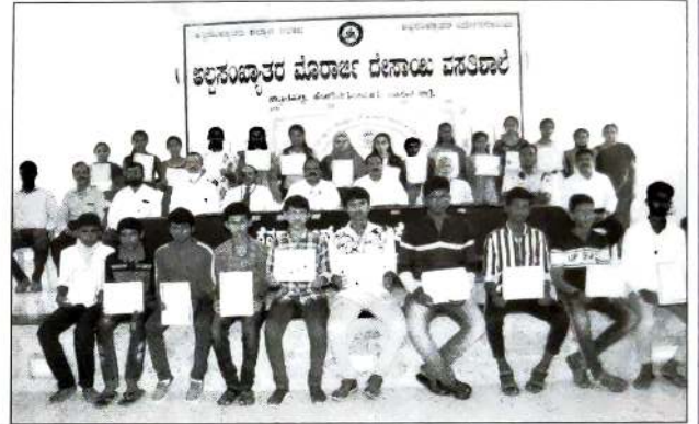
The brightest and the best – with the dignitaries at the 'Pratibha Puraskara'.