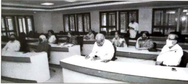
CBJEF's governing body and other members at the AGM