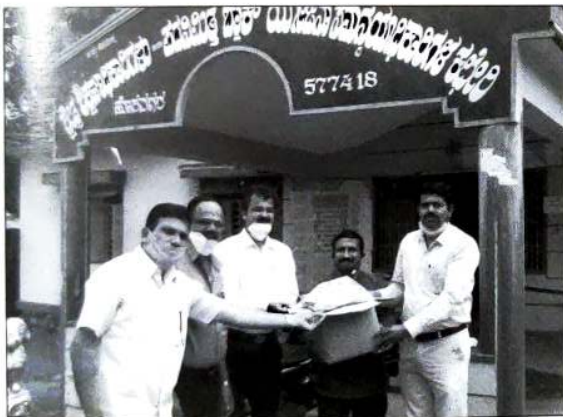
Hosanagara (Shimoga dist.): Mask distribution programme for students