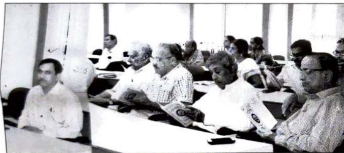
Participants at the AGM.