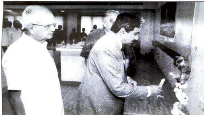
Lighting the lamp of knowledge