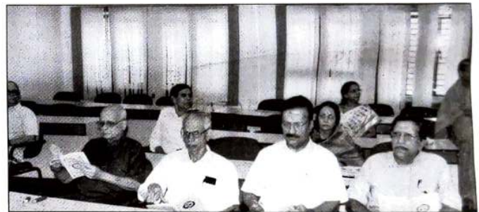
Participants at the AGM.