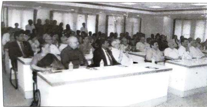
Participants: Canara Bank executives, governing body members and other invitees.